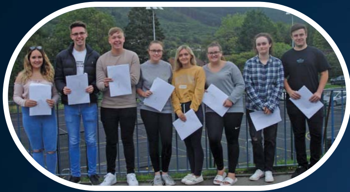
Pupils with at least 3A*/A