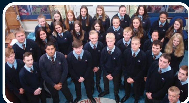
Pupils who achieved GCSE Mathematics a year early