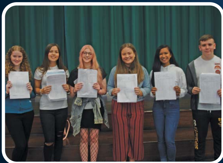
Some of the pupils who achieved 10A*/A grades and above

There were fabulous GCSE results as the class of 2019 improved upon last year's results and 100% of Year 11 pupils leave with recognised qualifications – a wonderful achievement for pupils of Treorchy Comprehensive School!