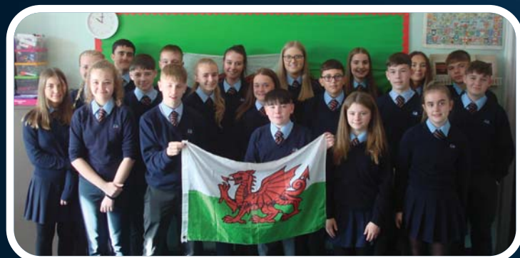
Cwrs Carlam – Pupils who achieved GCSE Welsh 2 years early