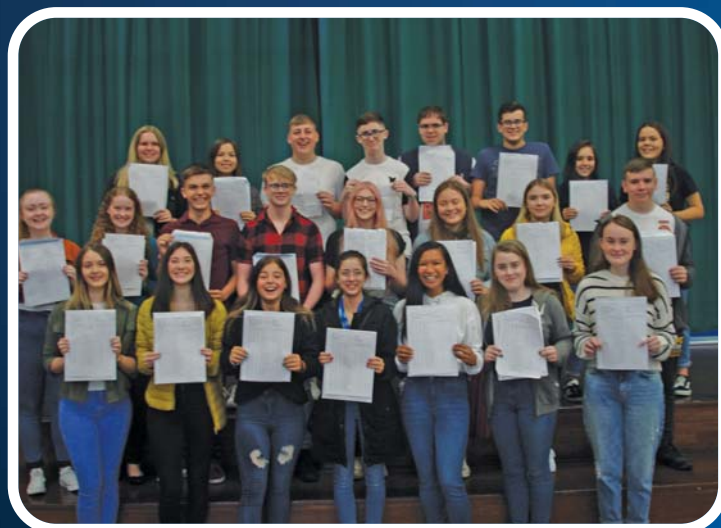
Some of the pupils who achieved 5A*/A grades and above

An outstanding 100% of pupils who studied in Year 11 achieved recognised qualifications this year and it was gratifying to see 148 students securing at least 5 A*-C grades, an increase on last year. It is also very pleasing that 90% of the pupils achieved the Skills Challenge Certificate, an