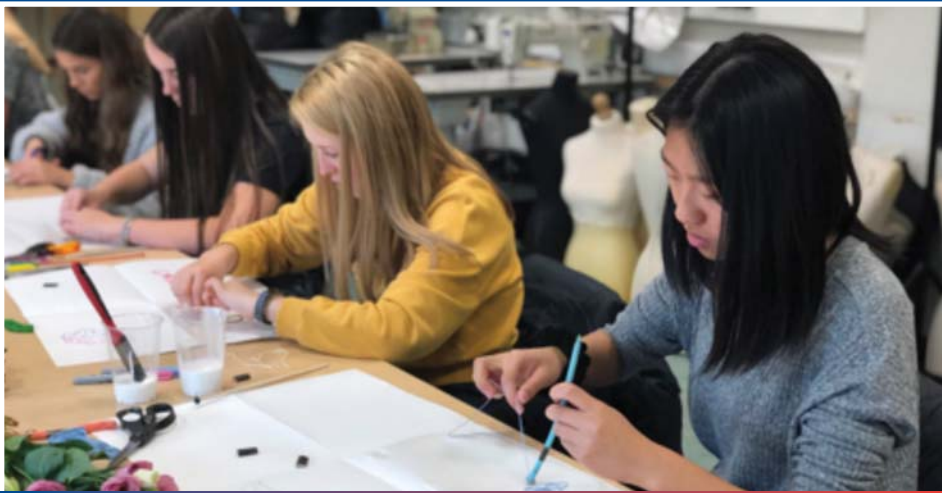
Year 12 and 13 Art pupils developing new drawing techniques

On Thursday 28th October, a group of Year 11, 12 and 13 Art students took part in a practical mixed media workshop, where they had the opportunity to develop new drawing techniques that challenged the way they usually work. They also got to experience the structure of the Art