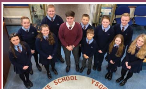
Our new Senedd Ysgol members for 2019-20

Now that this new structure is in place, look out for further updates on the work of our newly formed pupil voice groups as we move through the Spring and Summer terms!