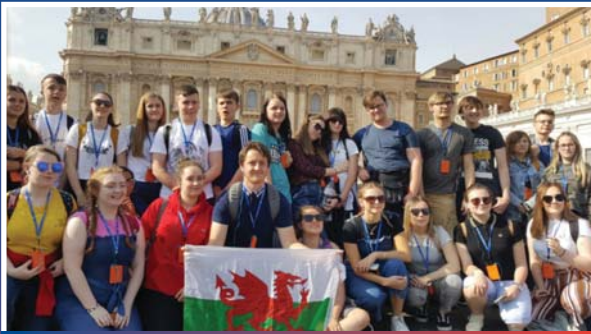
Year 12 and 13 pupils at the Vatican City

Over half term, 34 Year 12 and 13 Historians ventured to Italy to continue their studies into Mussolini's Italy and broaden their historical understanding of ancient Rome.