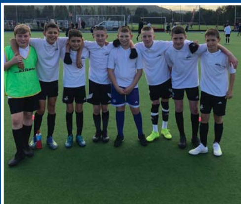
Year 8 at the RCT Cup tournament

This year, all teams were entered into the RCT Cup and the Welsh Cup respectively. We have had some great success, in particular with the boy's Year 9 football team.