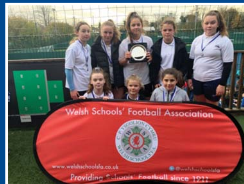
Year 7 and 8 team at the Welsh Schools Football Association National Fives tournament

The Year 7 and 8 teams have also done well! The Year 7 boys' team have reached the semi-final of the RCT cup where they will hopefully give another great