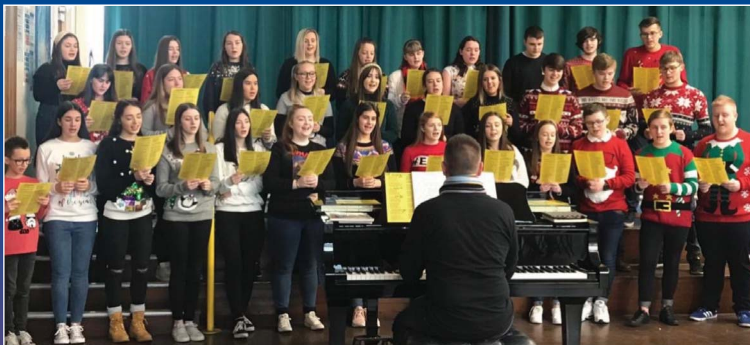
Senior Choir entertaining the community at the Christmas Fayre

Treorchy Comprehensive School began our Christmas celebrations with a bang as we celebrated with a Christmas Fayre in the Main Hall on Saturday 7th December. There was fun for all the family as a variety of stalls drew the community together. Many departments, year groups and the wider family of the school contributed to this exciting day.