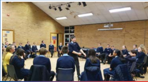
Year 9 pupils taking part in a mindfulness activity

In October we held our first Health & Well-being day of the year. These special days give pupils and staff the opportunity to experience workshops which develop our understanding of a range of topics which can impact our general health, our well-being or our community.