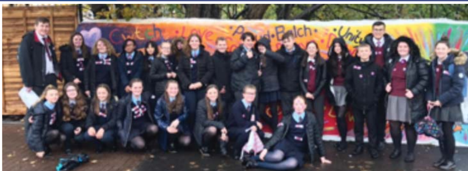
Celebrating Diwrnod Shwmae day in Treorchy

On Tuesday 15th October, Welsh AS and A level students along with Year 9 Fast Track students went into Treorchy town to celebrate Diwrnod Shwmae day. The pupils gave out stickers to the local residents and businesses with the aim of promoting how important it is to keep the Welsh language alive and that everyone can help to contribute to this cause by using any Welsh words which they may know - even if it's only by saying Shwmae. Every words helps! As part of the celebration, they made a promotional video to further spread their message and the video was shared by the Welsh Language