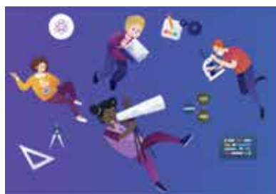
SCIENCE & TECHNOLOGY