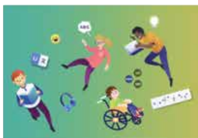
LANGUAGES, LITERACY & COMMUNICATION