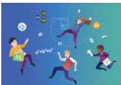
MATHEMATICS & NUMERACY