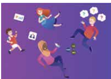
HEALTH & WELL-BEING